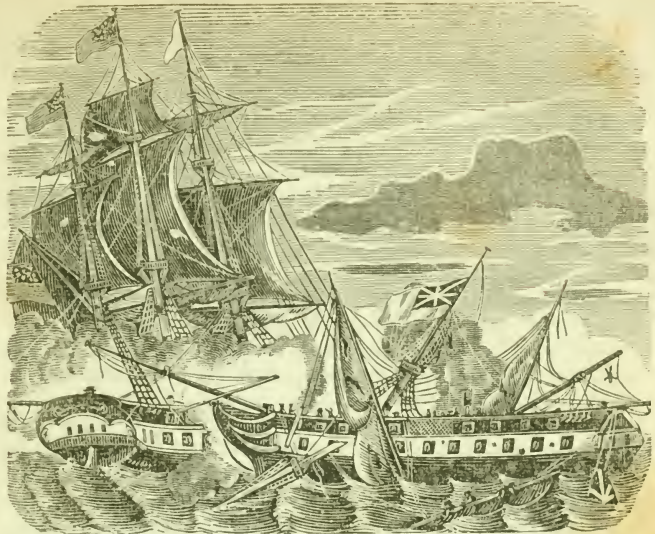
BATTLE OF THE CONSTITUTION AND GUERRIERE.....COMMODORE HULL.